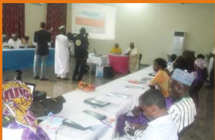
(BELOW) The Training on Social Media for Peace Campaign for CSOs in North-east held at RiverEdge Hotel, Bauchi