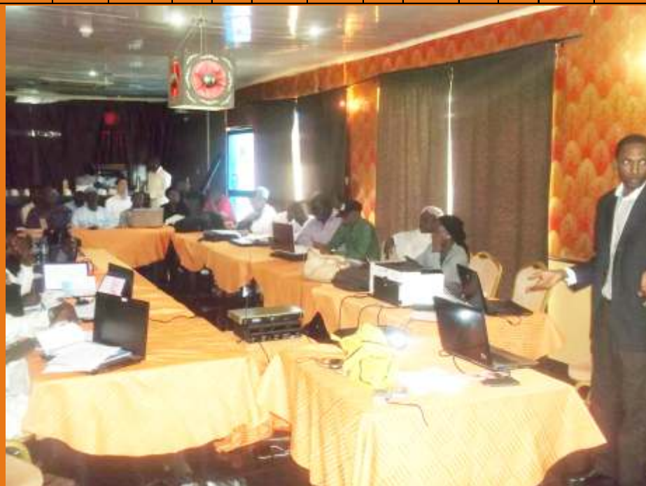
Workshop on Social Media for Peace Advocacy for CSOs from North-central held at View Point Hotel, Abuja