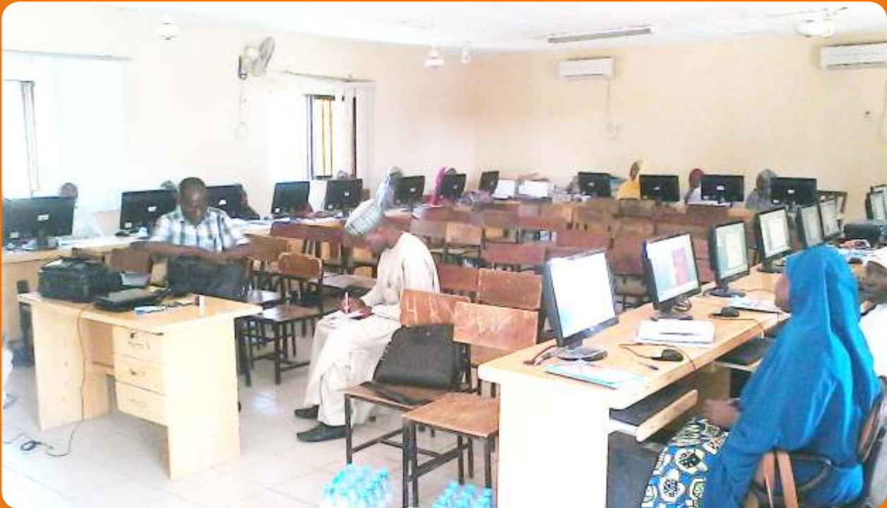
Participants (Female Teachers of Secondary Schools) on the first day of the WeTech's ICT training for Women and Girls held at the Computer Lab of Rumfa College Kano