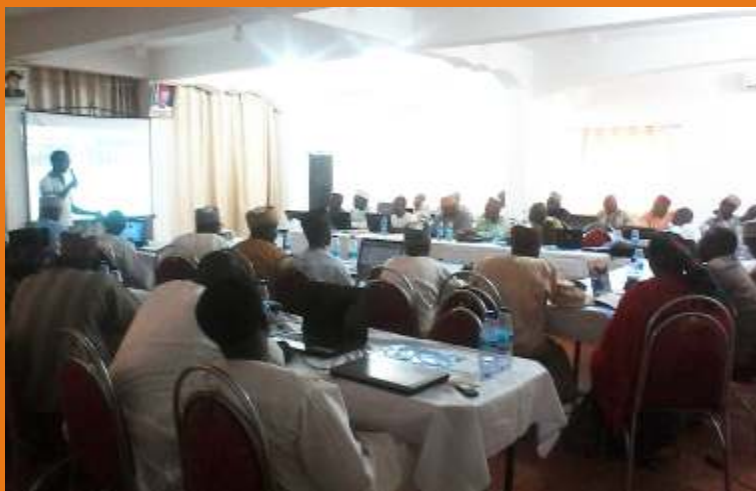
(TOP) Participants during the Training on Social Media for CSOs in Yobe State held on 18th and 19th of February 2014 at Nassarawa Guest House in Kano.